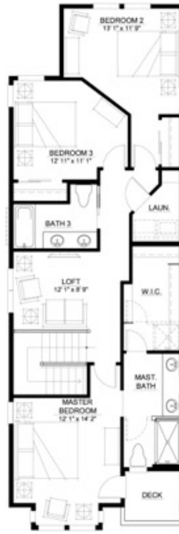
2 nd floor